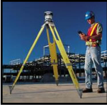
done using GPS.

For larger projects, surveyors are increasingly using the Global Positioning System (GPS) , a satellite system that precisely locates points on the earth by using radio signals transmitted via satellites . To use this system, a surveyor places a satellite signal receiver, a small instrument mounted on a tripod, on a desired point. The receiver simultaneously collects information from several satellites to establish a precise position. Surveyors then interpret and check the results produced by the new technology. The receiver also can be placed in a vehicle for tracing out road systems. Because receivers now come in different sizes and shapes and the cost of the receivers has fallen, much more surveying work is being